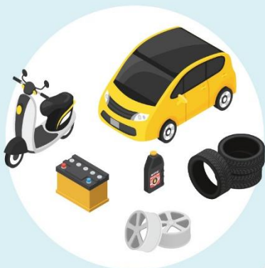
Vehicles & accessory