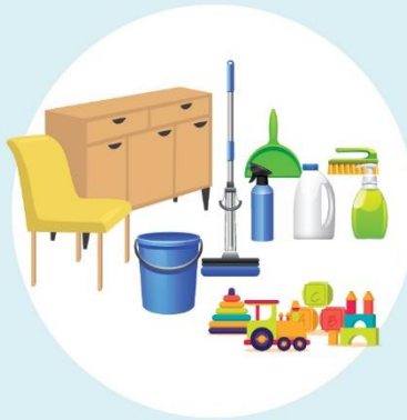
Home & Living Products