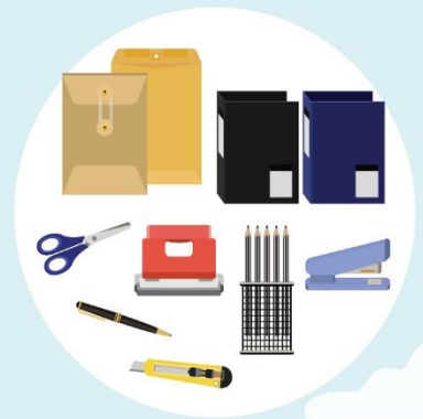
Office supply products